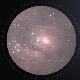
Image/Observation Before Deep Dark Technology

Automatic detection and removal of light pollution